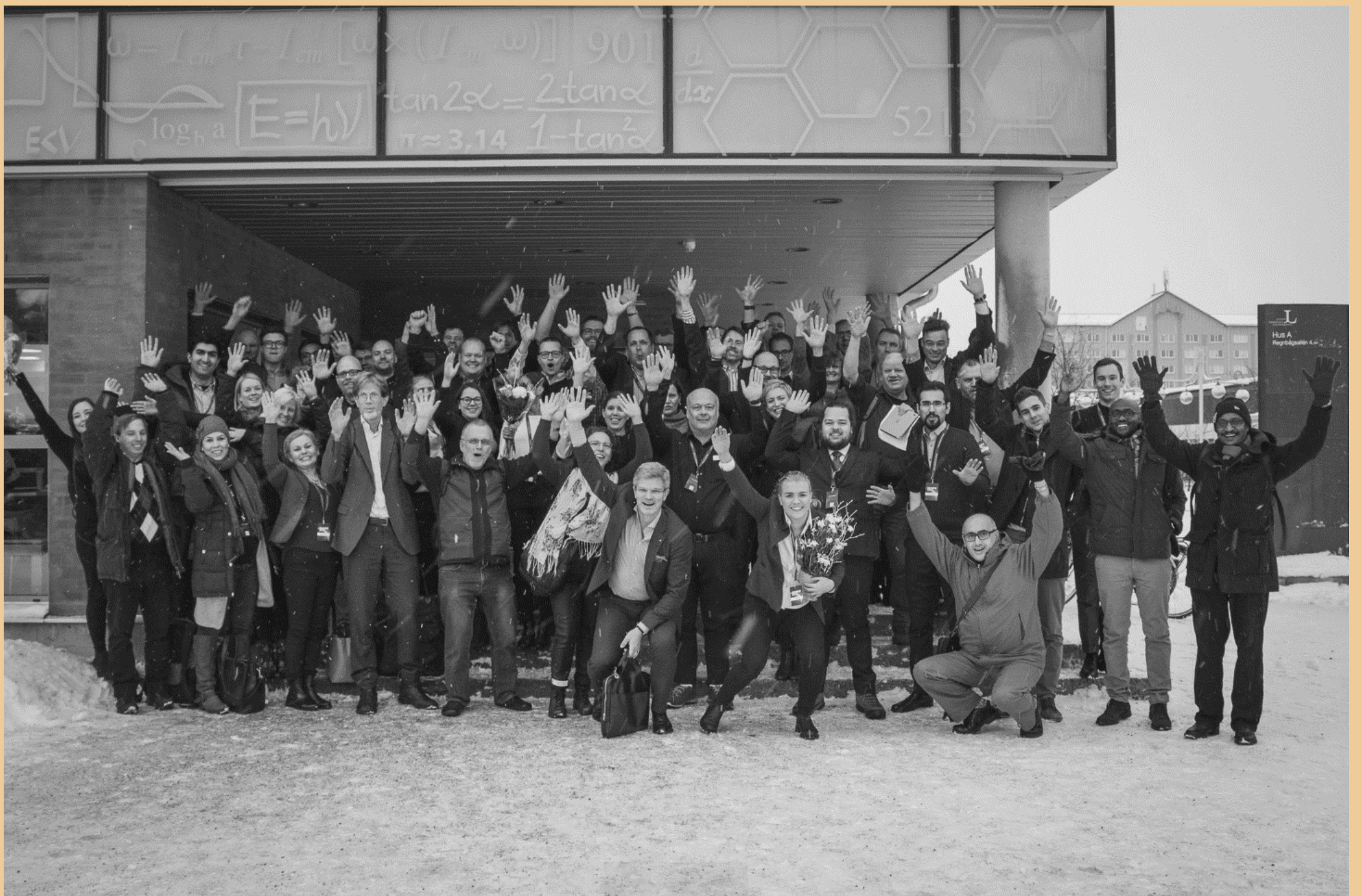
Participants at last years conference in Luleå, Sweden